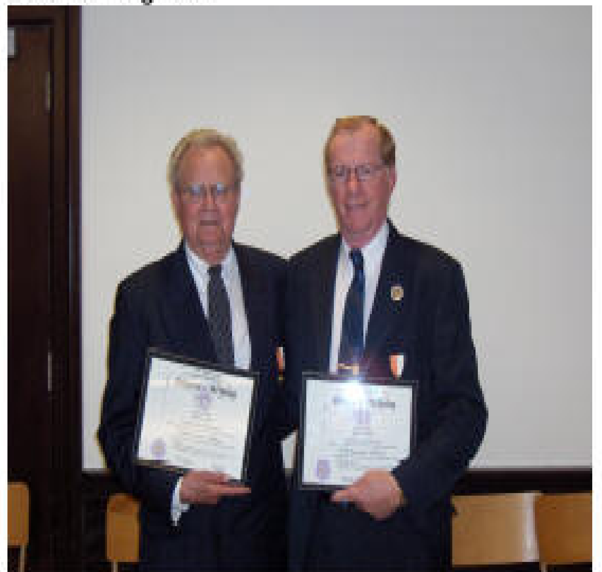
This award is for meritorious service to and for DeMolay.