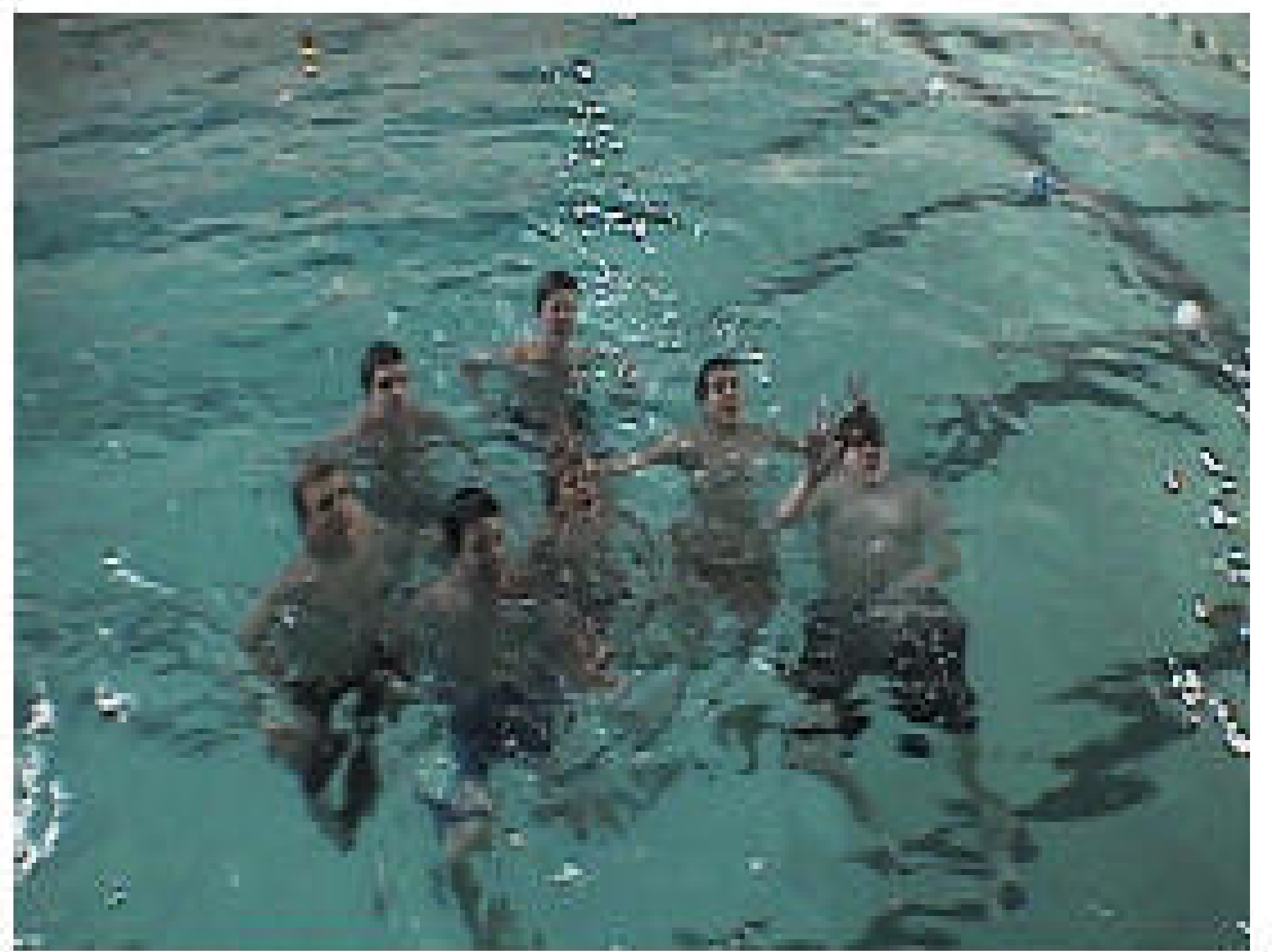
“Where do we sign up for the synchronized swim?”