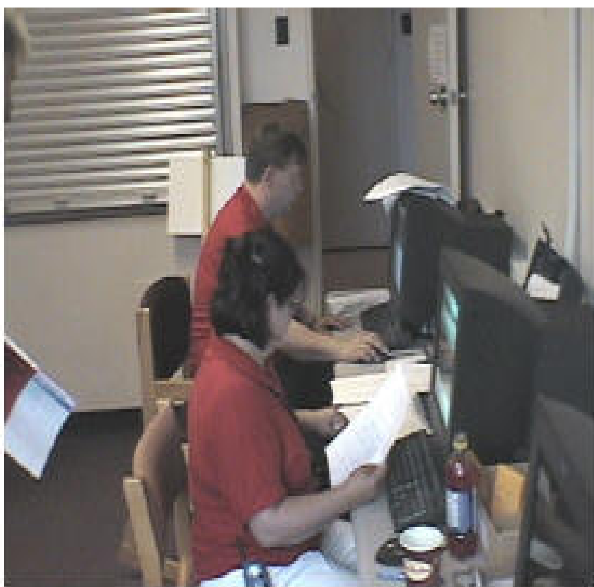
The heart and soul of the convention at work.

Advisors and DeMolay visit the food Hall. More on FOOD later.