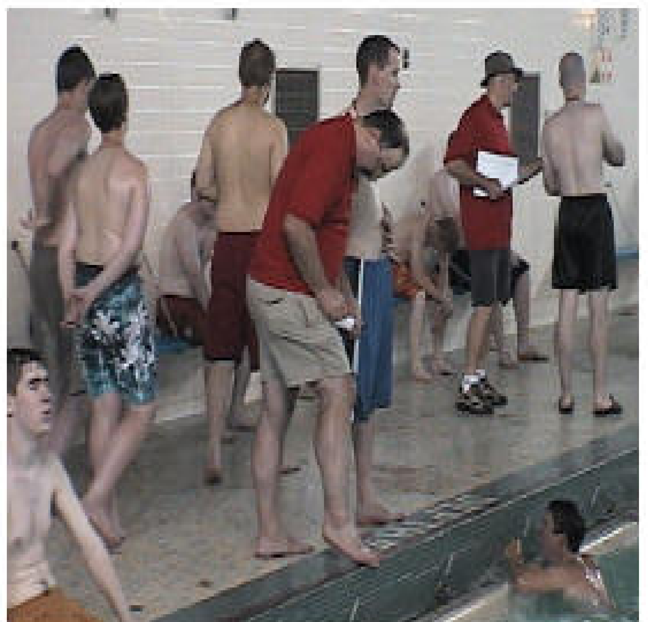
“Yes, I’ll take your order for the cheeseburger, but you can’t eat it in the pool.”