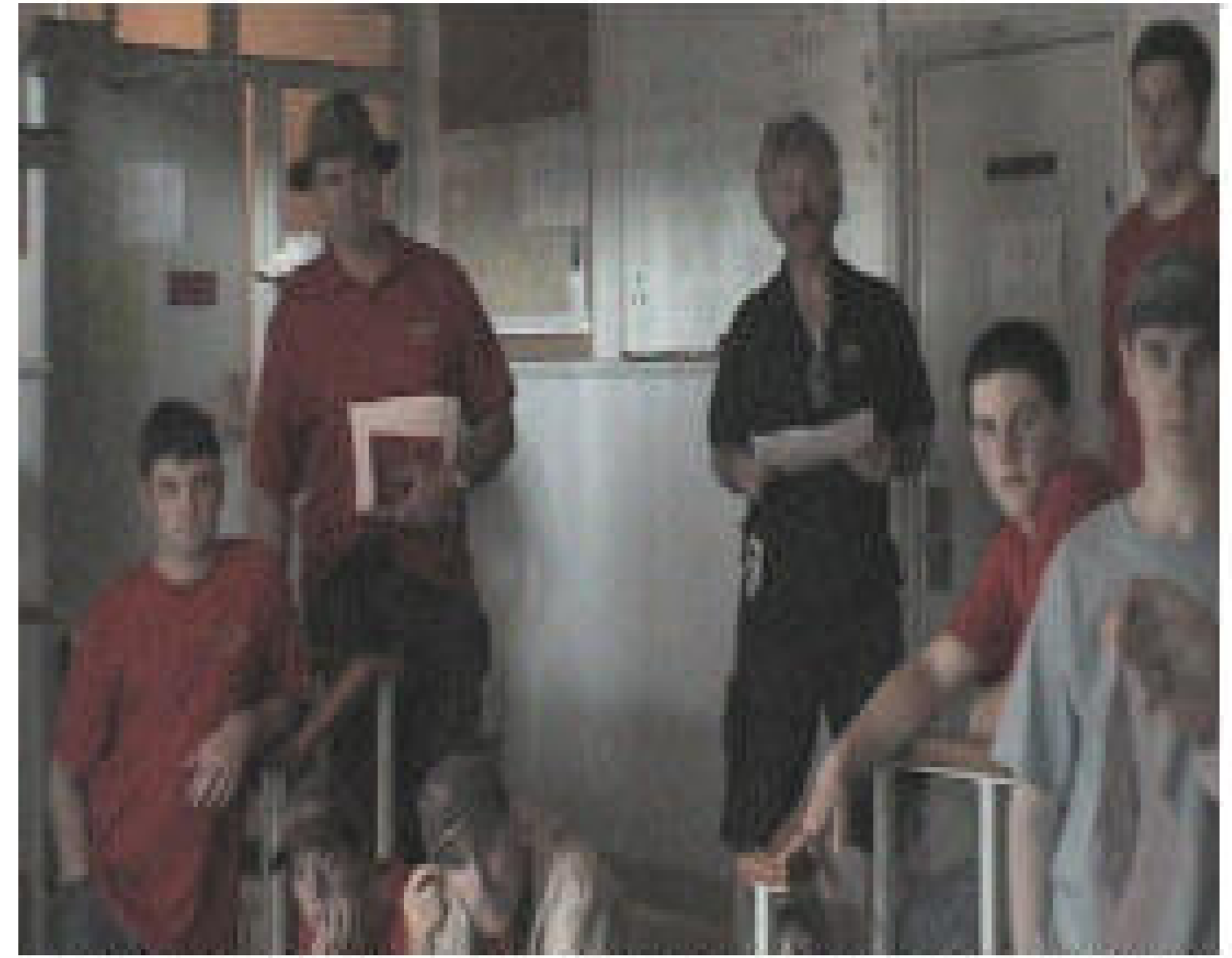
Early arrivals are either enthused or dismayed.