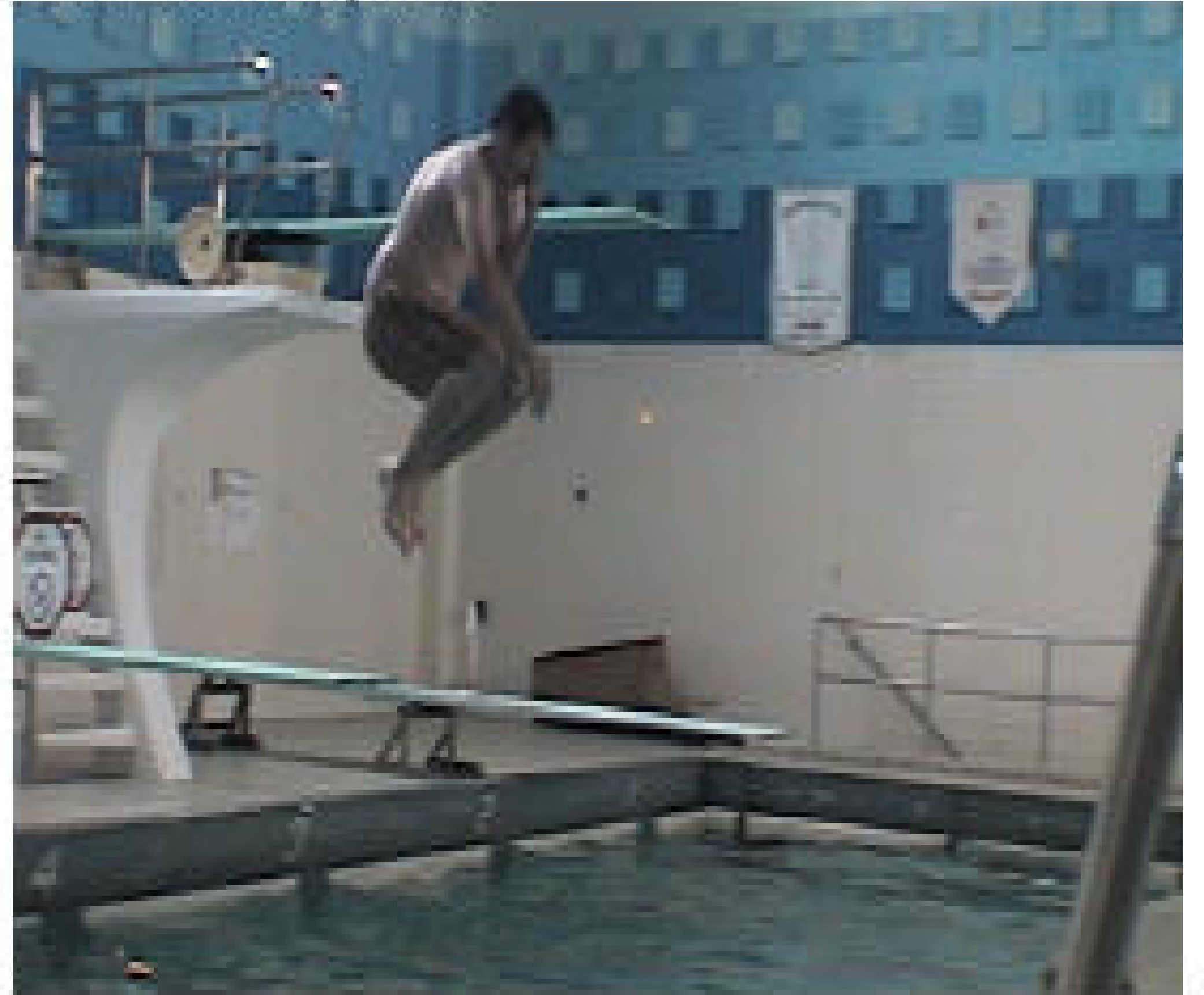
This would be cannon baller is expected to finish this dive on Saturday