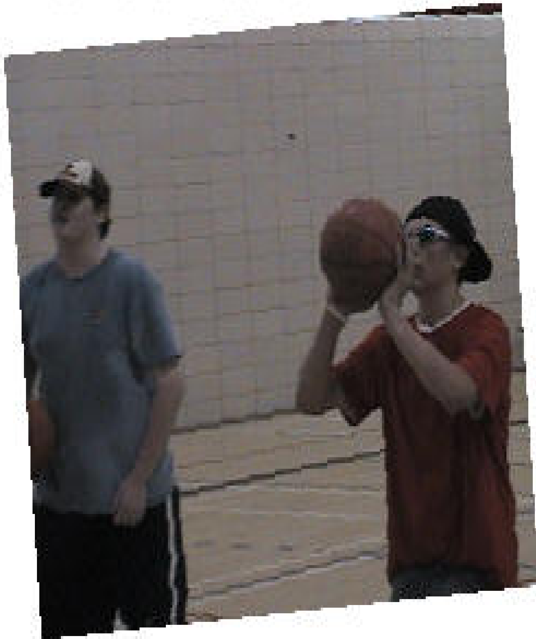
J. L. C. members were kissing the basketball off the rim while practicing free throws. Team 4 on 4 goes today.